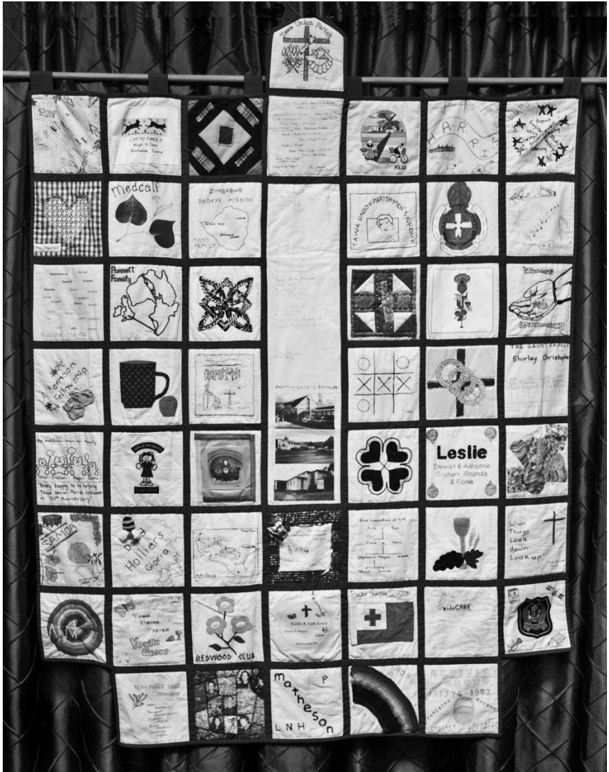
The Parish 30 th Banner